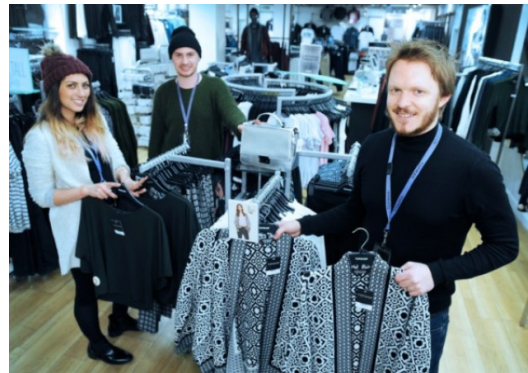
Retail staff who are asked to wear the company's own clothes can not claim a tax deduction for those clothes.

If you're unsure about the tax deductibility of your work related clothing, we invite you to contact us to discuss the rules and regulations.